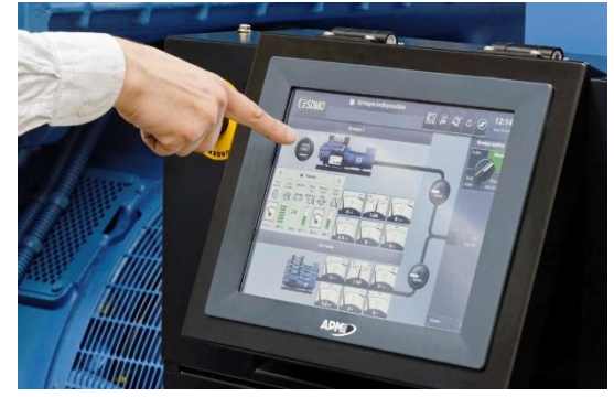
APM802 dedicated to power plant management

The new APM802 command/control system is specifically designed for operating and monitoring power plants for markets including hospitals, data centres, banks, the oil and gas sector, industries, IPP, rental and mining. This unit is available as standard on all generating sets from 275 Kva designed for coupling. It is optional on the rest of our range. The Human Machine Interface, designed in collaboration with a company specialising in interface design, facilitates operations with a large 100% touch screen. The pre-configured system for power plant applications features a brand new customisation function which complies with the international standard IEC 61131-3. New communication functions (PLC and regulation), improve the high level of equipment availability in the installation.